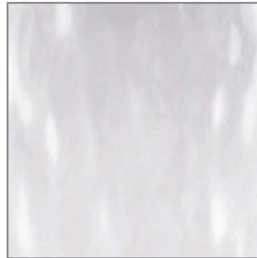
Water Glass GL2WG

G lass may be ordered loose as priced in the Huntwood Catalog or “factory installed” via the MDIG modification. When ordering “loose,” specify exact width and height dimensions of the glass panel (example: 14 ¼” wide x 16 ½” high). If you need help calculating glass panel size for a specific cabinet/door size, contact Customer Service for assistance. When ordering glass “factory installed,” you will need to select a glass door modification (MDFG, MDFGU, MDGM, MDPM, MDQM, MDGMXP, MDGMG) and apply it to the respective cabinet (or loose door) to “prepare the door for glass;” you will then apply the MDIG modification to the cabinet (or loose door) to install the glass. Glass is ordered (and priced) separate of the cabinet (or loose door) and its respective glass door modification.