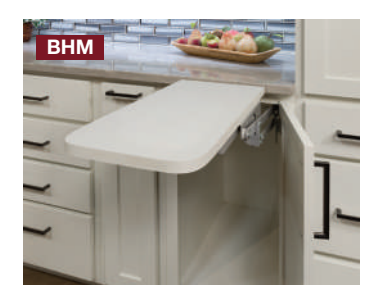
Base High Mixer