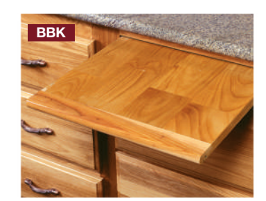
Breadboard & Drawers Solid hardwood breadboard pulls out.