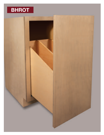
Base High Roll-Out Tray Divider Base Roll-Out Divider