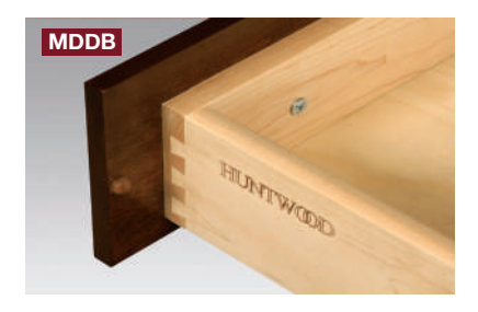
5/8" Solid Maple Dovetail Upgraded 5/8" thick solid Maple drawers with 1/4" thick captive bottom. Drawer fronts receive permanent bumper pads.