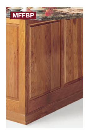
Raised or Recessed Finished Back Panel