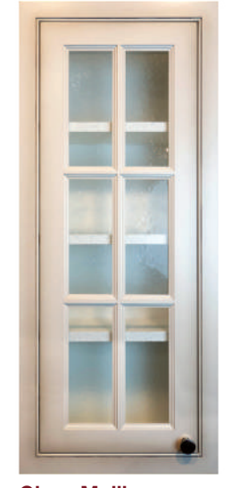
Glass Mullion MDGM