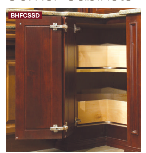
Corner w/ Deep Wood Susans