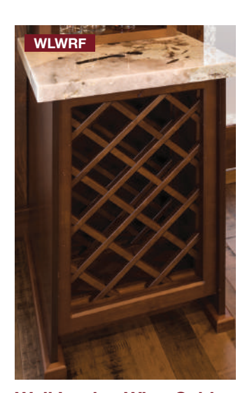
Wall Lattice Wine Cabinet