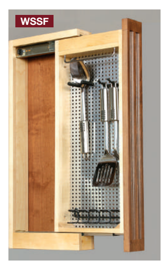
Pull-Out Peg Board Stainless steel panel, hooks & pegs.