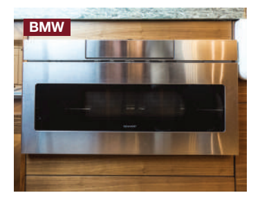
Base Microwave Cabinet Custom cut-out fits most base microwaves.