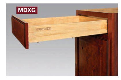
Full-Extension Guides Provides full-access with soft-close. MDXGHD Heavy-duty stabilizer bar

option reduces side-side movement when fully open.