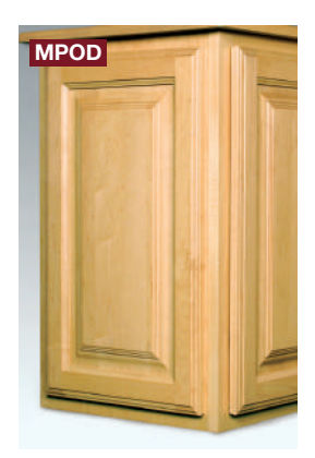
Plant-on Door Finished end w/plant-on door. MEPOD Flush with front door.