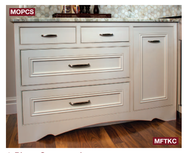
1-Piece Construction Flush Craftsman Toekick