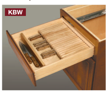
Wood Knife Block