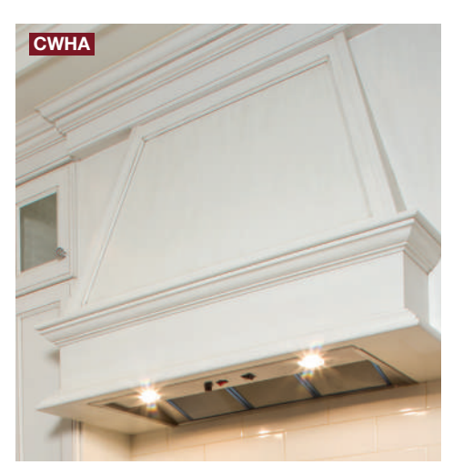
Storefront Hood A