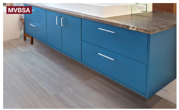
Floating Vanity Modification Modifies back for suspended application. Deletes toekick.