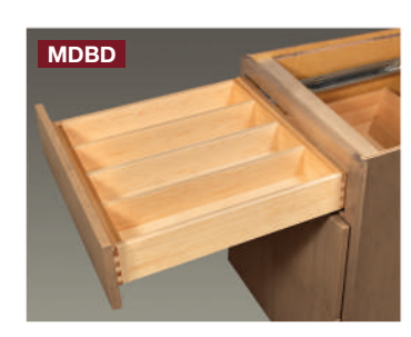
Drawer Box Dividers