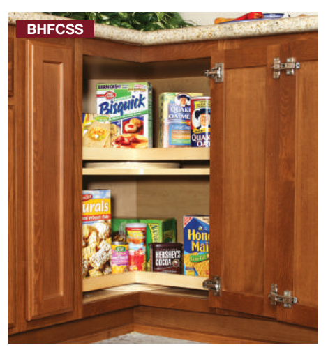
Corner w/ Wood Lazy Susans