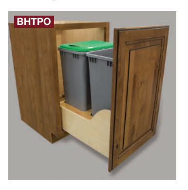
Base High Waste/Recycle