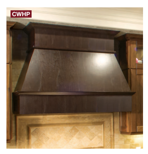
Custom Hood, Plain