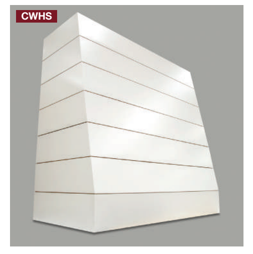
Custom Hood with Shiplap Styling