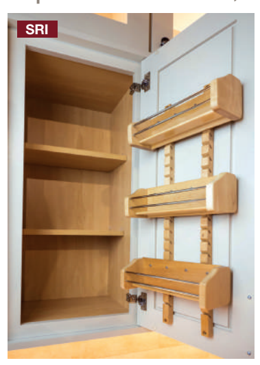
Wood Spice Racks Wood spice shelves & chrome rails.