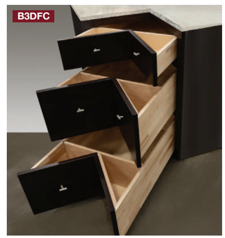
3-Drawer Corner Cabinet