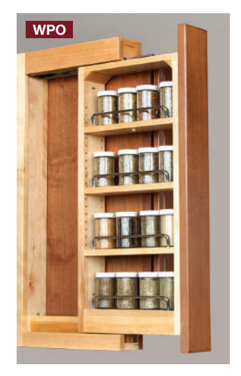
Pull-Out Spice Rack 3" to 6" pull-out for spice storage.