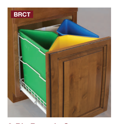
3-Bin Recycle Center