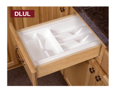
Utensil Drawer Liner