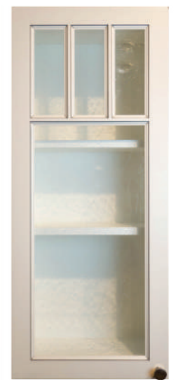
Prairie Mullion MDPM