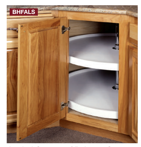
Angled Corner w/ Polymer Susans