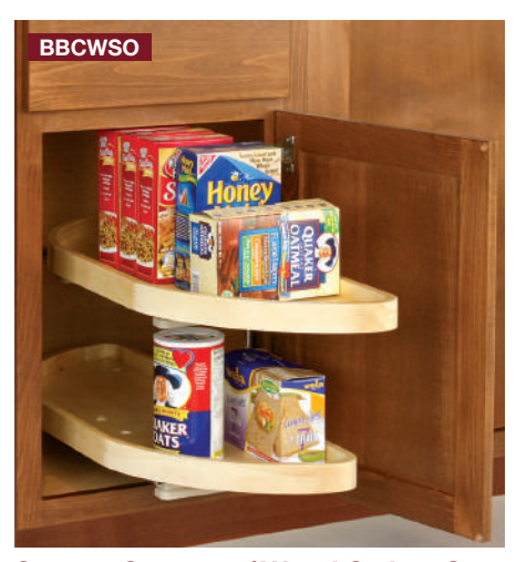
Square Corner w/ Wood Swing-Outs