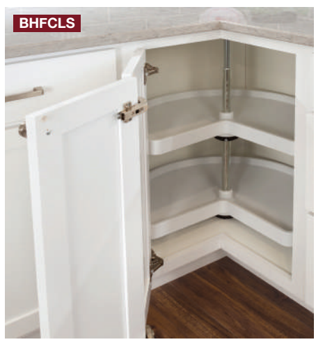
Corner w/ Polymer Susans