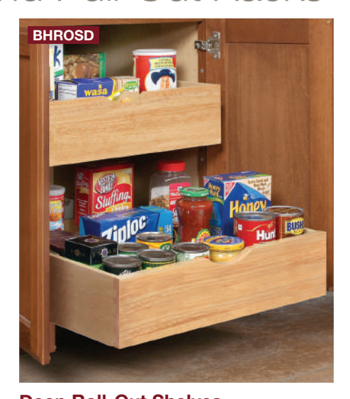
Deep Roll-Out Shelves 6 1/4" deep roll-out shelves provide full access. Provides more secure storage for taller items.