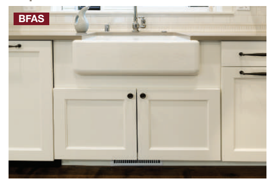
Farmers Apron Sink Cabinet Base Farmers Apron Sink Cabinet