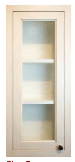
Glass Door MDFG