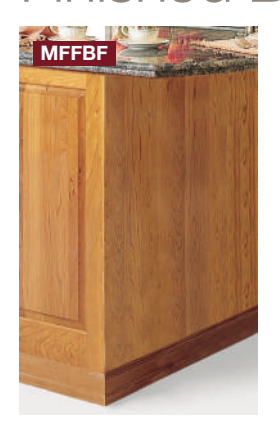
Flat Flush Finish Back Panel