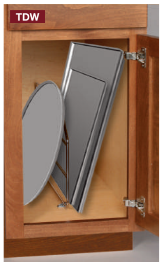
Base Wire Divider