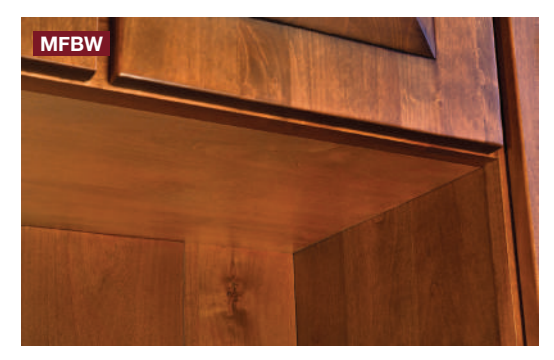
Finished Bottom Wall Cabinet