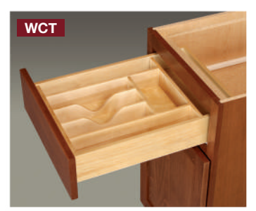
Wood Cutlery Tray