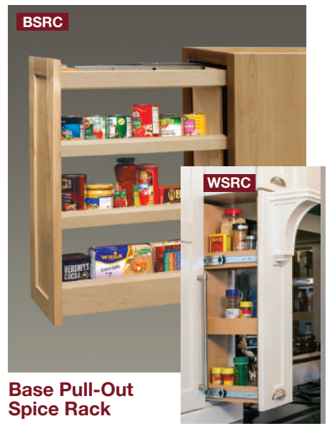
Wall Pull-Out Spice Rack