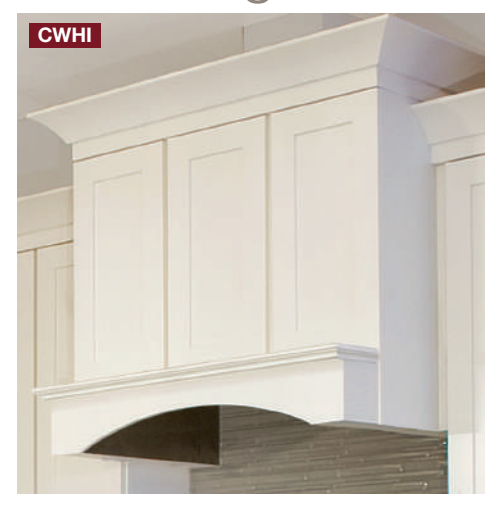
Wall Hood, Large