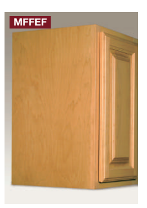
Flat Flush Finished End Finished end is flush with face frame.