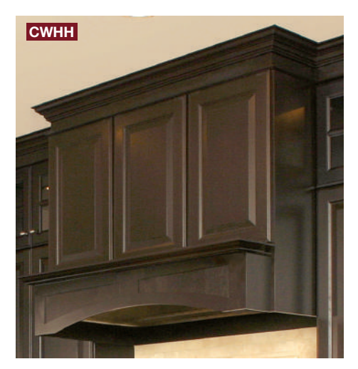
Wall Hood H