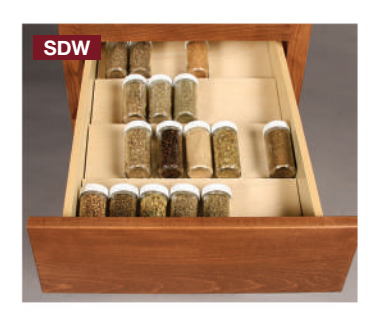
Wood Spice Insert