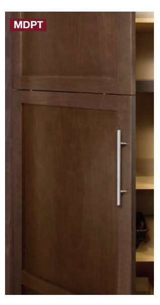
Pin Doors Together