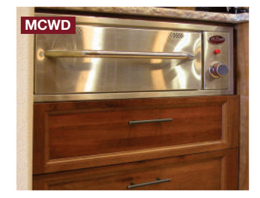
Base Warming Drawer Custom cut-out fits most warming drawers.