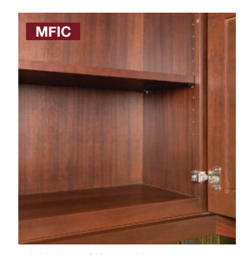
Finished Interior Same wood & color as exterior.