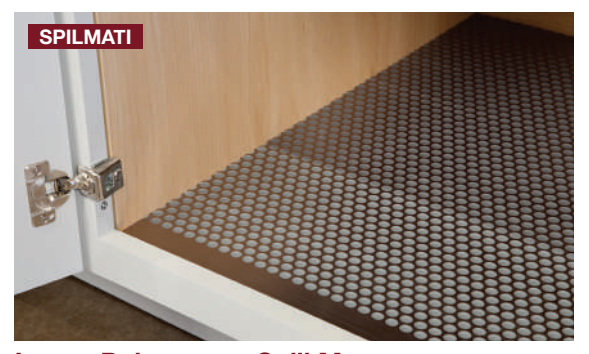
Loose Polystyrene Spill Mat Small divots in the mat work to capture spilled liquids.