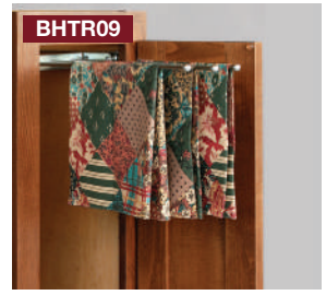
Base High Towel Rack