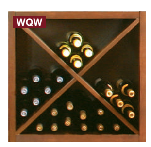
Wall Qtr Wine Storage