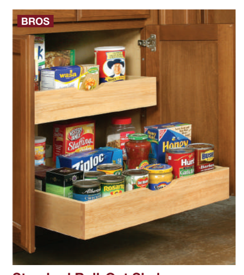
Standard Roll-Out Shelves 3 3/4" deep roll-out shelves provide full access.