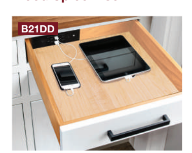
Cabinet w/ Docking Drawer